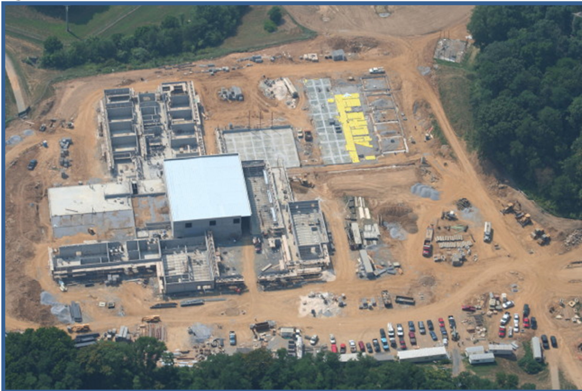
Figure 1: Landis Run Intermediate School While Under Construction

Landis Run Intermediate School, seen in Figure 1, is a $28 Million, 210,000 SF school located in Lancaster, PA which will serve grades 5 and 6 in the Manheim Township School District. The notice to proceed was given on December 10 th , 2010 and has an anticipated completion date in August of 2012. The project duration is approximately 20 months and the project deadline is the driver of the project due to the fact that the district has nowhere else to place the 5 th and 6 th grade students scheduled to occupy the building. The school is one of four school buildings on a large campus, which is surrounded by homes located on the other side of a landscape buffer. The building itself is a load-bearing masonry design with brick veneer. The building is striving for LEED Silver certification. The project will utilize a combination of design features and construction practices in order to achieve the LEED Silver rating. BIM was utilized heavily in the planning and design phase of the project. However, BIM was not used during the construction phase of the project and although it is supposed to be implement during the occupancy phase of the project it is still unclear to what extent.